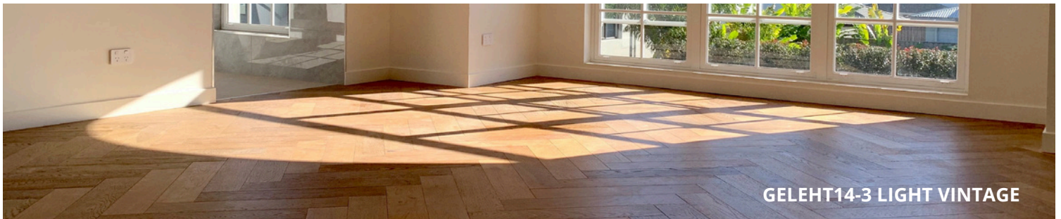
GELEHT14-3 LIGHT VINTAGE