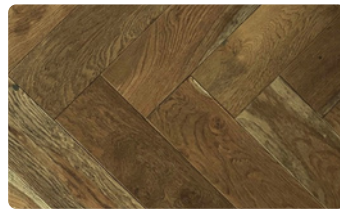
LIGHT VINTAGE GELEHT14-3