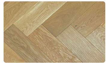
TASMAN OAK GELEHT14-4