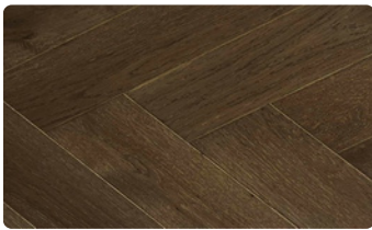
DARK VINTAGE GELEHT14-1