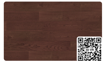
AMERICAN WALNUT GELET142-28