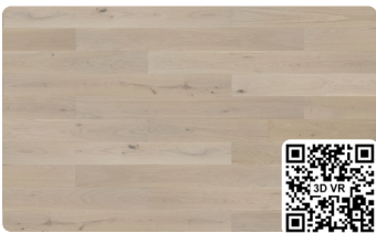
LINEN OAK GELET142-25