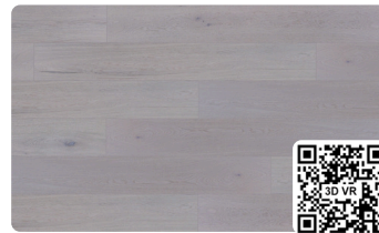
WHEAT OAK GELET142-23