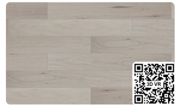
CHALK OAK GELET142-24