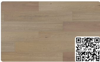
TOFFEE OAK GELET142-21