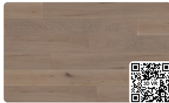
ALMOND OAK GELET142-22