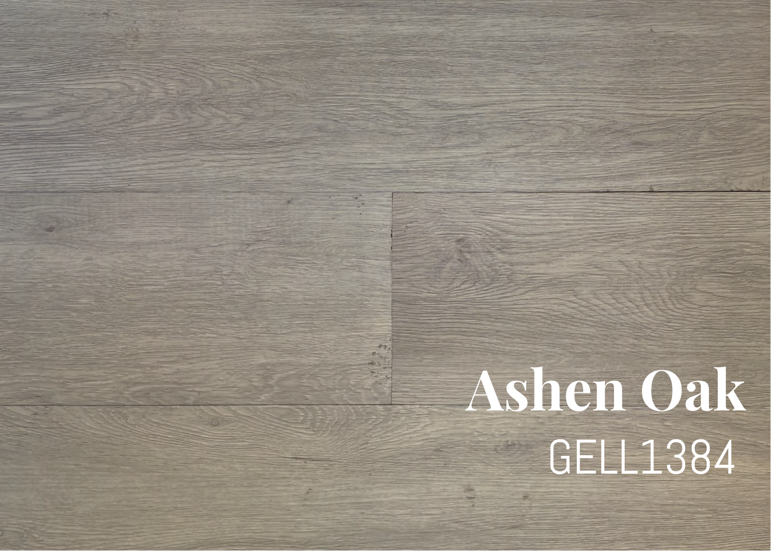
Ashen Oak GELL1384