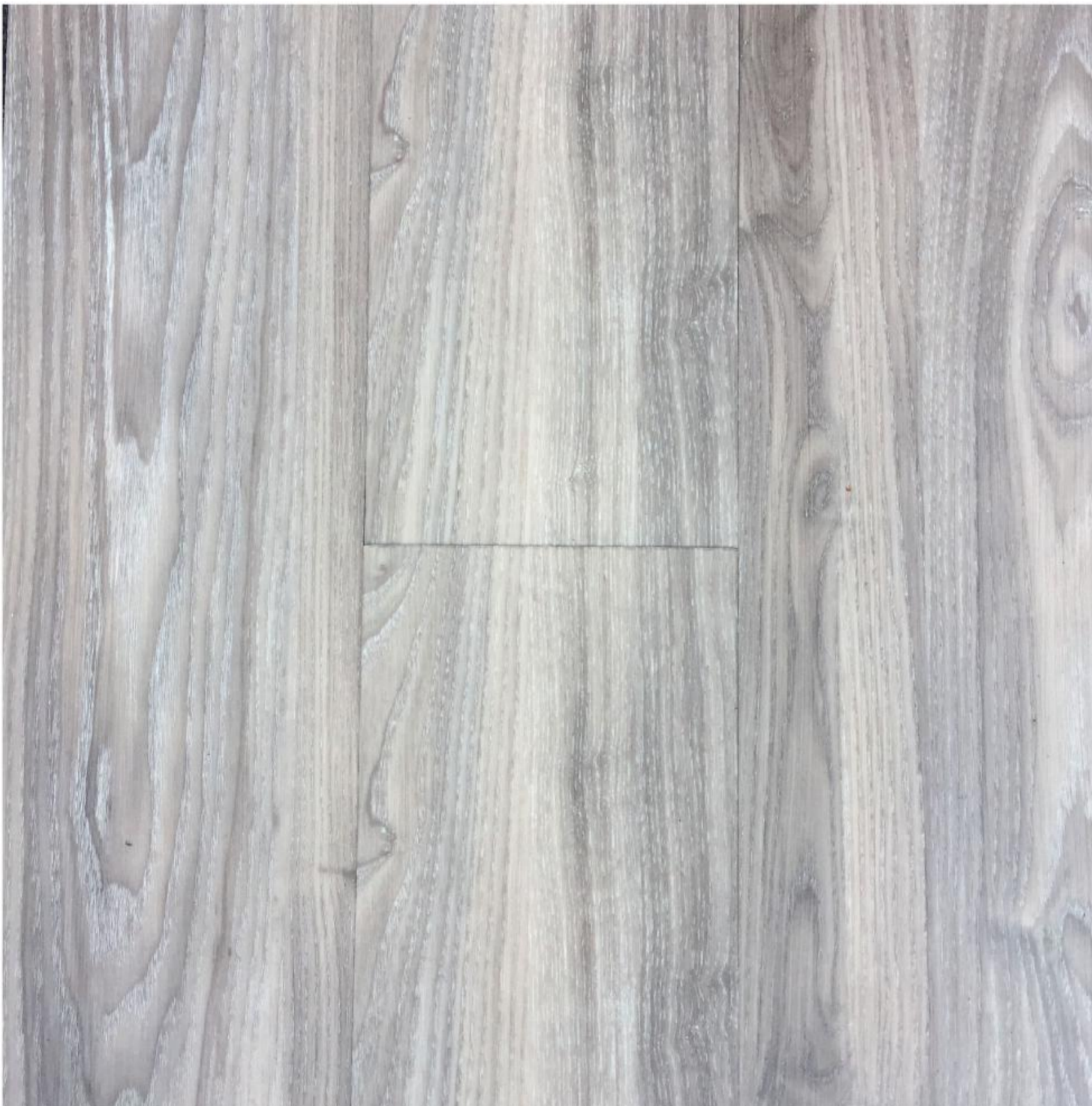
Ash Land GELL19-14