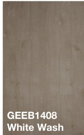
GEEB1408 White Wash