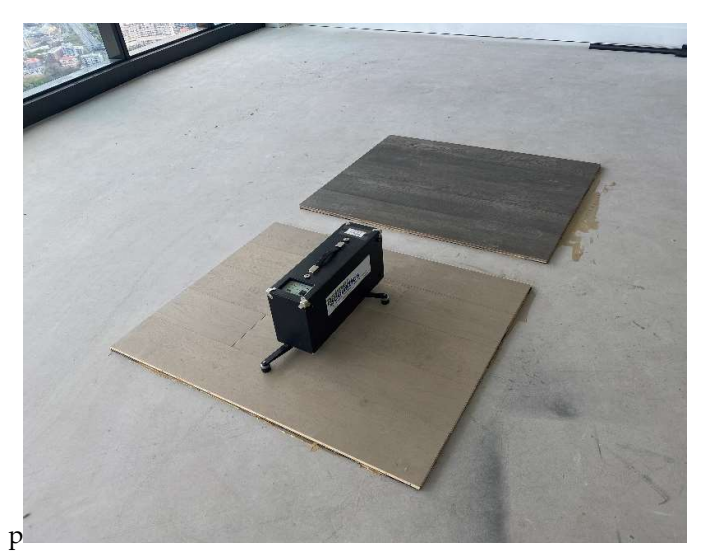
Figure 1: Testing at U8701, 222 Margaret Street, Brisbane.

Slab Concrete; Walls: Plasterboard; Ceiling: Plasterboard; Floor: Concrete; Room finish: Unfurnished.