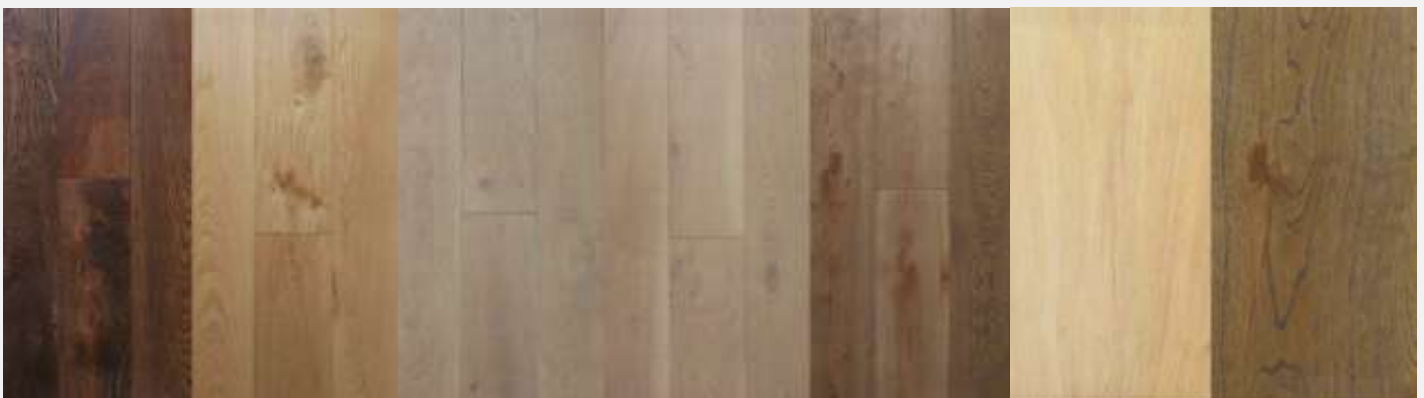
AMERICAN WALNUT GELET14401 GELET15401